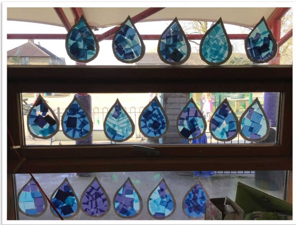
Hokusai and Monet Classes