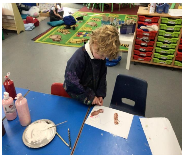
Hokusai and Monet Class.